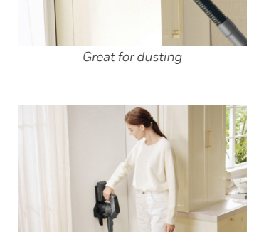
Easily store when done