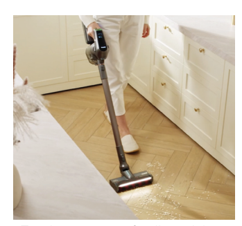
Tangle-resistant soft roller with brite white LED light strip for hard floors