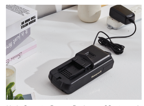
High-Capacity Battery Pack up to 60 minutes*