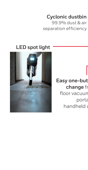
Easy one-button change from floor vacuum to portable handheld unit