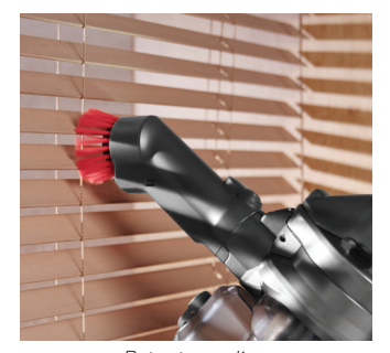
Patent-pending motorized rotary brush