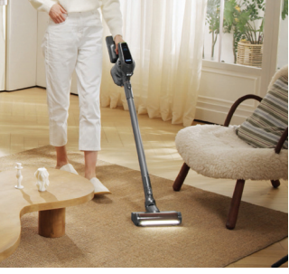
Tangle-resistant carpet roller with brite white LED light strip