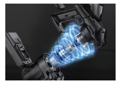
Innovative 600W SyncroMax™ Digital Motor up to 185 AW Powerful Suction