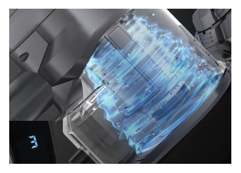
ISC Technology for Superior Self-Cleaning